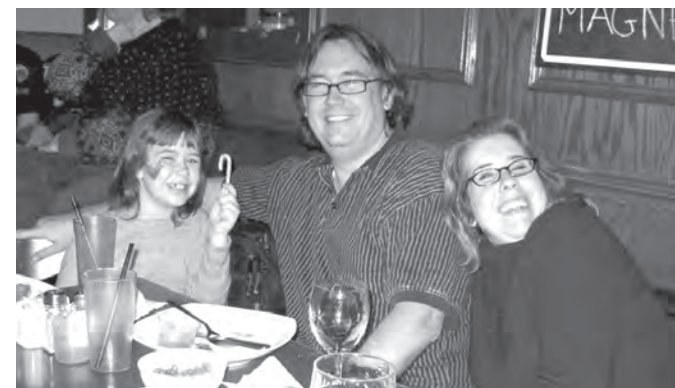
The Lloyd family enjoy the festivities