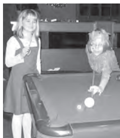
Shooting some pool