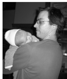
Baby's first Christmas