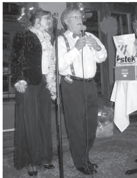
Auctioning that wonderful Vistek camera