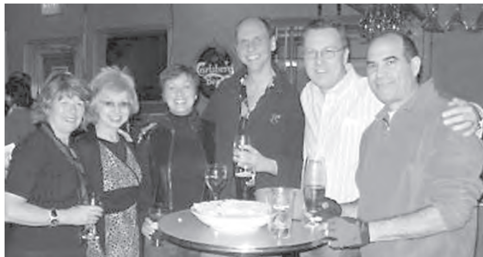
Corktown Friends come together for a good cause