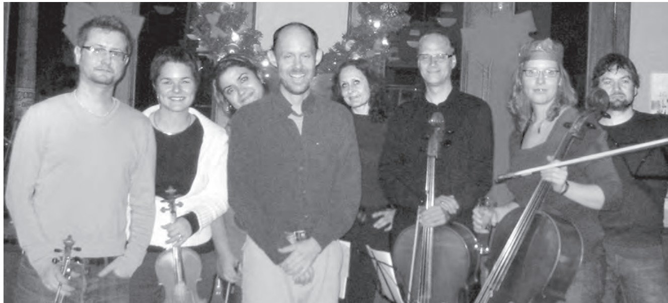
Corktown Chamber Orchestra – Please visit the CCO website at www.corktownchamberorchestra.com for news of upcoming events.