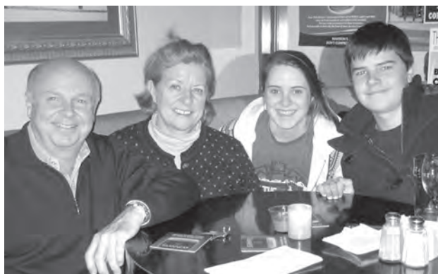
The Corktown Christmas Party is always a family affair